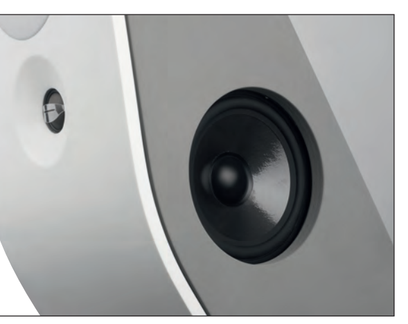
The Audax drivers with their Aerogel membranes can cope with any high-end assembly.

audio system. The Ella loudspeakers are well suited for living areas. With a height of 43" and a width of less than 8" they are of lean and dainty stature – compared to high-end speakers with the size of a wardrobe commonly feared by spouses. The speaker is clad in white (also available in black) and its tapered top is rather reminiscent of a sound