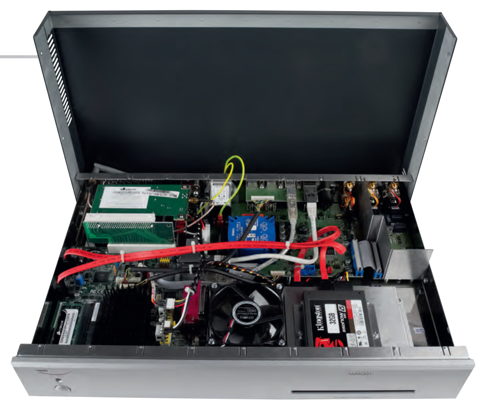
The internal hard disk houses the operating system and buffers ripping data. The fan in the center is absolutely inaudible.

Except for the mandatory gain control which adapts the sensitivity to any preamplifier, there is only one more potentiometer that attenuates the bass range below 300 Hz and allows you to position the Ella near a wall. As the lean loudspeaker system produces more than enough bass when this control is turned fully up, you can finetune the over-