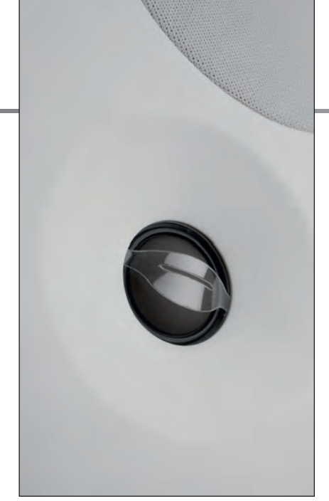
The French tweeters belong to the best that loudspeaker technology has to offer. This one uses a magnesium dome membrane.

As these membranes are sufficiently sturdy in the bass region and exhibit very few resonances in the mid and treble regions, they are perfectly suited for low/mid loudspeakers. The two laterally mounted transducers are not adapted for radiating to the sides, rather each of the three 5" speakers receives identical signals. At first glance this might seem odd, but makes sense on closer examination. The low/mid trio is mounted at equal distances to the tweeter and thus facilitates a clean transition to the treble speaker range. In addition this configuration radiates the sound up to the mid range more consistently into the room. And this is pretty remarkable for a low/mid speaker which is relatively large in comparison with the tweeter. Ella's rather small membrane diameters are advantageous in this case. On