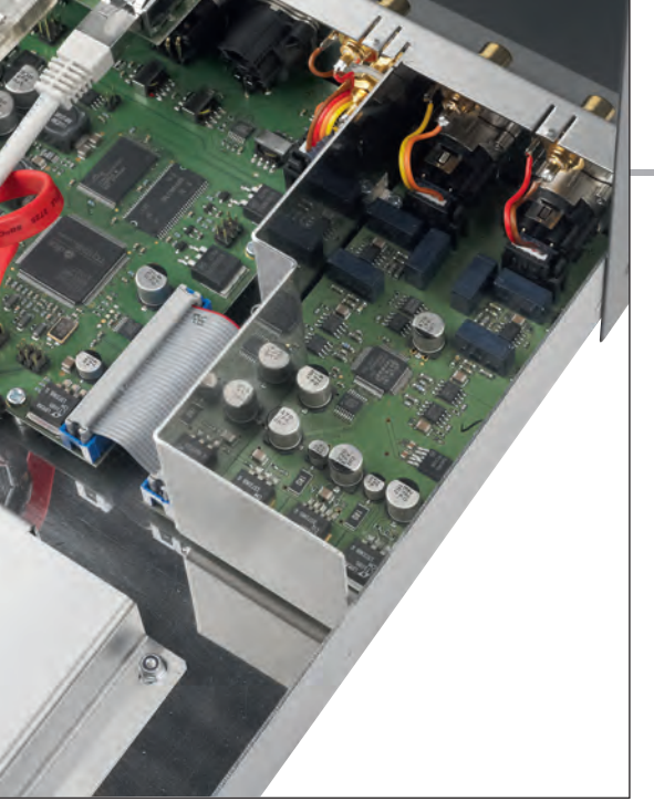
Daniel Weiss' excellent DAC processes the data received from the network.

audio system. The Ella loudspeakers are well suited for living areas. With a height of 43" and a width of less than 8" they are of lean and dainty stature – compared to high-end speakers with the size of a wardrobe commonly feared by spouses. The speaker is clad in white (also available in black) and its tapered top is rather reminiscent of a sound